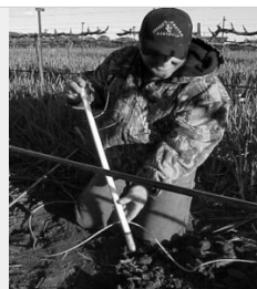
Irrigation water management