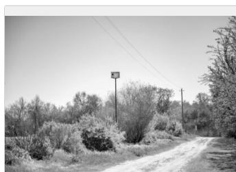
Windbreak or Hedgerow Planting