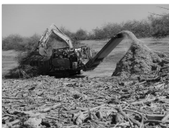
Whole Orchard Recycling