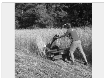
No Till or Reduced Till