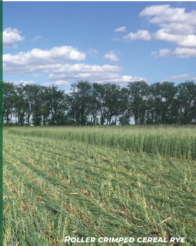
ROLLER CRIMPED CEREAL RYE

Expansion of the FCSS program is critical not only to the success of the program but also to accelerate adoption of cover crops on Illinois cropland.