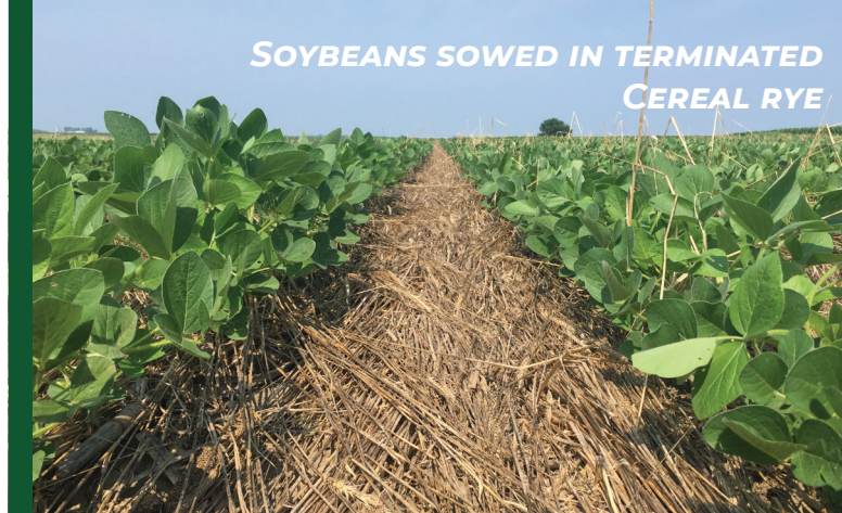
SOYBEANS SOWED IN TERMINATED CEREAL RYE

Cover crops are one of the most important tools for increasing soil health. By increasing soil health over the long term, the landscape can withstand some of the impacts from weather extremes. During heavy rainfall events, increased water infiltration and residue cover drastically increases water that can store and stop erosion. During dry periods, by keeping the ground cool and covered, there is more water available for the crop, reducing stress.