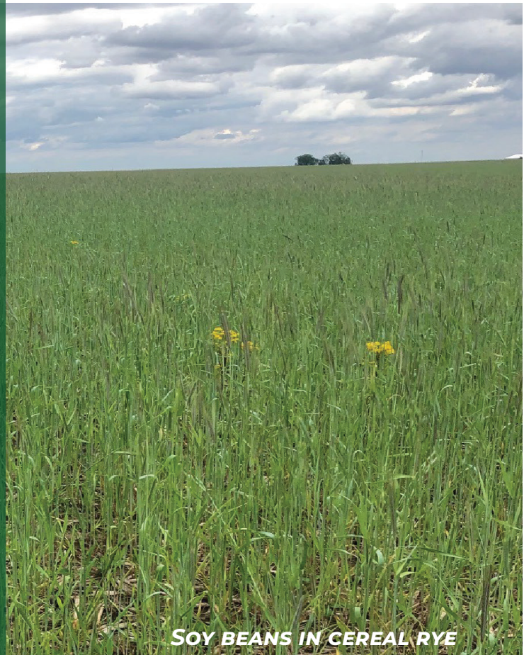
SOY BEANS IN CEREAL RYE

"Cover crops require additional planning in order to get them established during the harvest season." - Dave Schluckebier